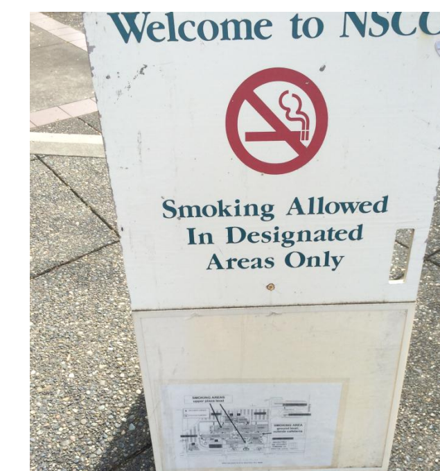
Only sign for designated smoking areas on NSCC campus