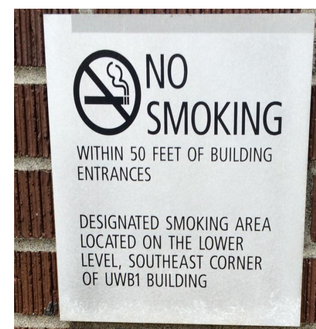
Exact sign is posted at each building entrance at UW Bothell