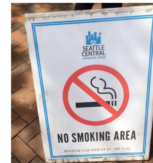
19 students were found smoking near this "No Smoking" Area at SCCC